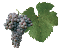
Rulandské šedé Pinot Gris