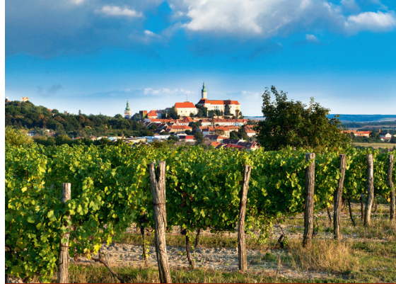
Mikulovska Wine Sub-region

Total Area: 3,146 ha | Wine Communes: 90 Vineyard Sites: 218 | Growers: 899