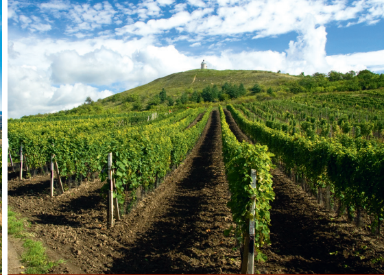
Velkopavlovicka Wine Sub-region

Total Area: 4,961 ha | Wine Communes: 30 Vineyard Sites: 185 | Growers: 1,892