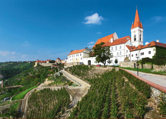
Znojemska Wine Sub-region

White wines from this westernmost region in Moravia are intensely aromatic and full of flavour and freshness thanks to the ideal natural and climatic conditions as well as the skill of the local winemakers. Cold winds from the nearby Bohemian-Moravian Highlands, together with the moderating influence of the Dyje, Jevišovka and Jihlavka rivers on the local climates, give the wines an unmistakably spicy flavour and fullness.