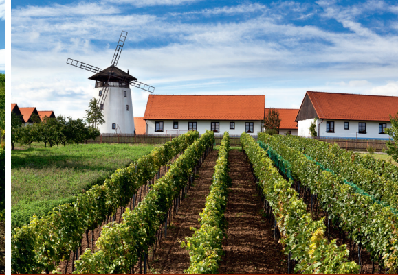
Slovacka Wine Sub-region

Total Area: 4,766 ha | Wine Communes: 70 Vineyard Sites: 321 | Growers: 5,467