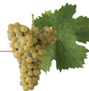
Ryzlink vlašský Welschriesling