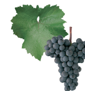
Svatovavřínecké Saint Laurent